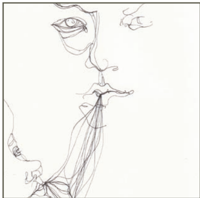
Julienne's upcoming works

Julienne Tan's upcoming mixed-media illustrations tackle the grey areas of human relationships and the immaculate fear of opening up to someone completely. The third-year ADM student will be putting aside words and present a series of printed illustrations that are a mixture of pencil, pen, paint and string in an effort to get closer to the viewer.